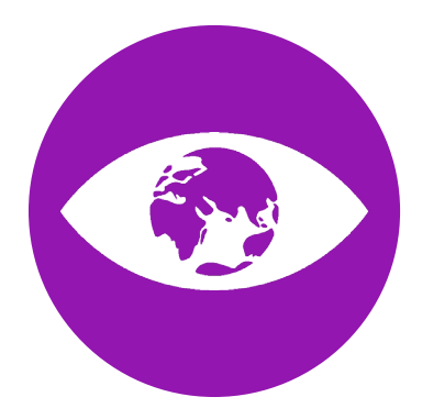
Use our expertise as engineers, scientists, and planners to enhance resilience to climate change through adaptation, while also seeking ways to reduce and eliminate greenhouse gas emissions.

Fuss & O'Neill is committed to supporting and contributing to the United Nations Sustainable Development Goals through both our business operations and our consulting services. We believe this creates long-term, shared value for our clients and our communities by meeting the needs of the present while working towards an environmentally, socially, and economically sustainable future.