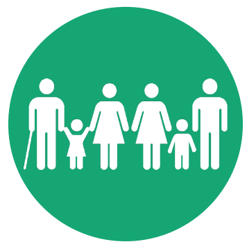
Work to create a more equitable, inclusive, and just society.