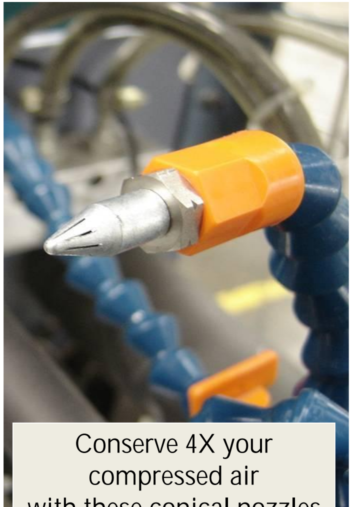
Conserve 4X your compressed air with these conical nozzles