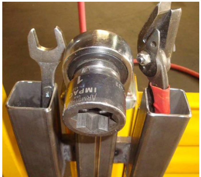
With a little creativeness from available stock, specific hand tools should be located in a holder at their Point-Of-Use spot.

We enjoy hearing from our subscribers. If you have ideas that you feel will help our readers as Single Point Lessons, please send us your lessons. Several subscribers have already submitted lessons that have been included in our previous mailings. Please send your ideas to: jkravontka@fando.com